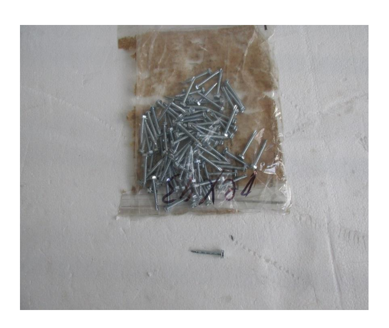
Screw type #10x11/2"-Tek3